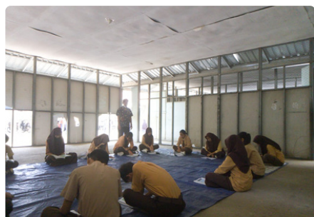
Learning activities at the emergency classroom