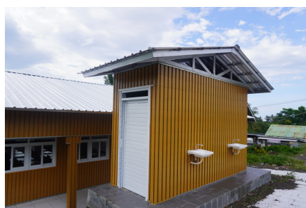
Block Classroom exterior