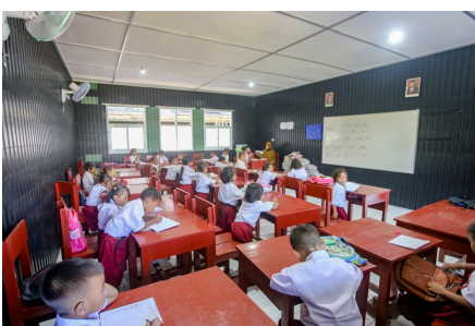
Block Classroom interior