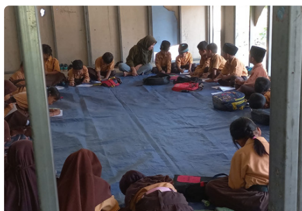
Learning activities at the emergency classroom