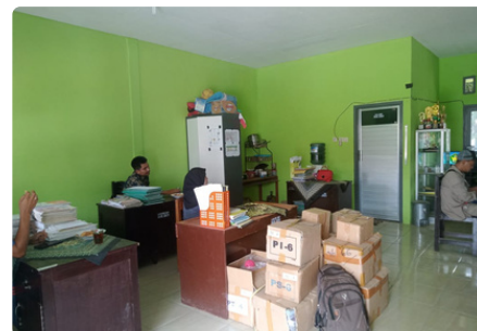
Staff room using health clinic room